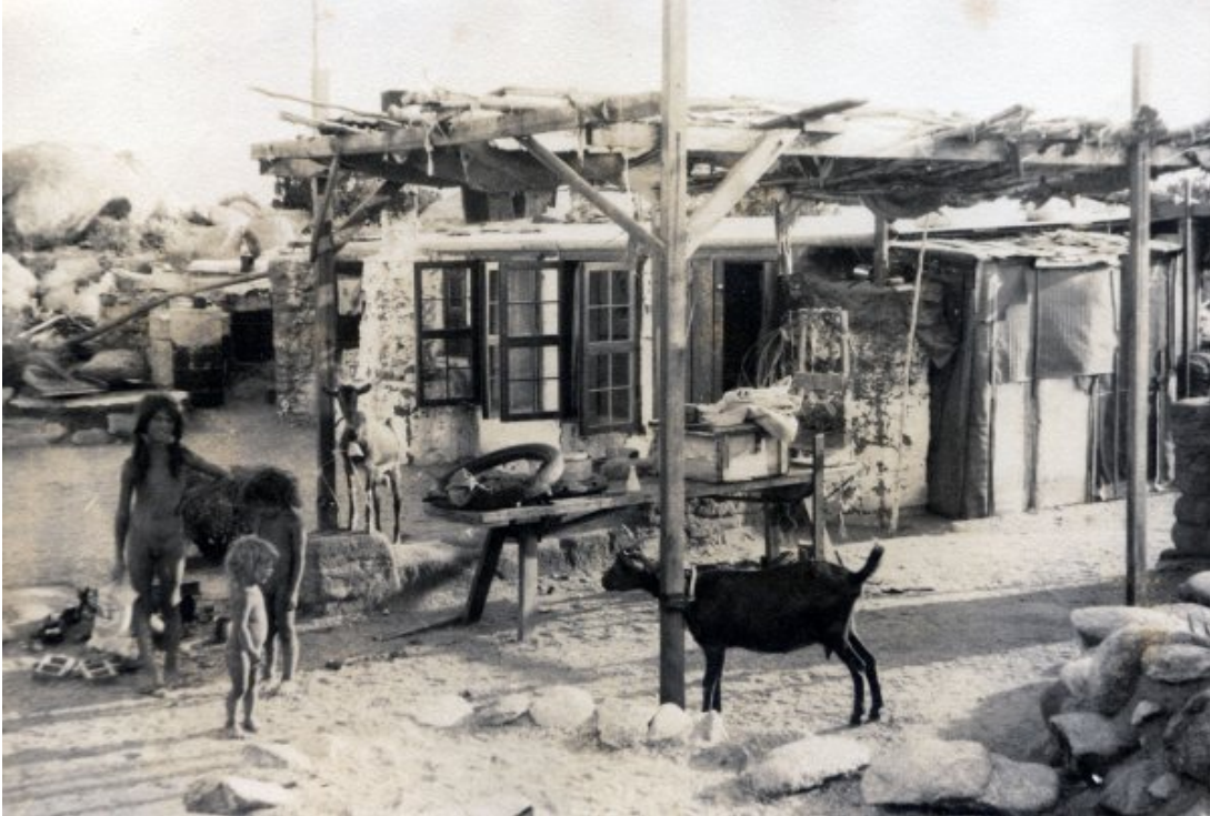
The desert house Kids and goats.

They had 3 children while in the desert, and lived a very primitive life, based Indian technology and customs, making the best out of the surrounding desert. They walked nude, had to collect rain water, built their house themselves, made potteries, waving, collected their own fire material, lived using what was at hand.