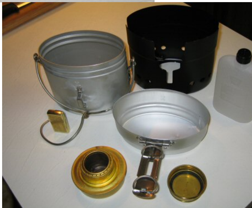
Svea Stove Unpacked