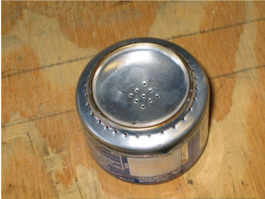
Single Wall Stove Burner