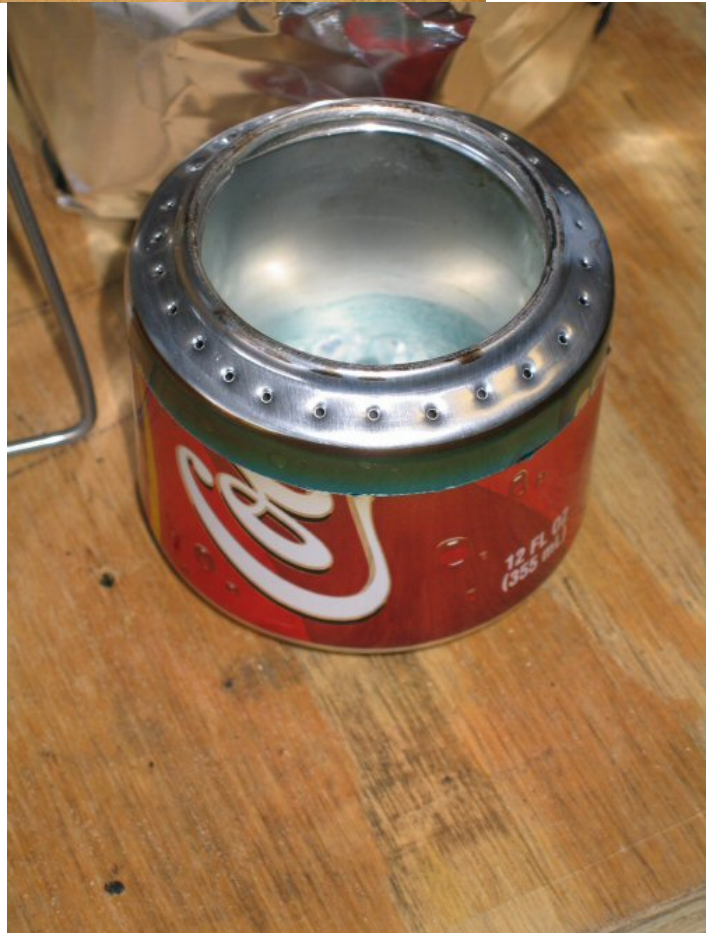
Double Wall Stove

The fuel for these stoves is denatured alcohol that I got at a local paint store. Fuel in the form of alcohol is readily available in many types of paint, auto, super mart and Wally-world type stores.